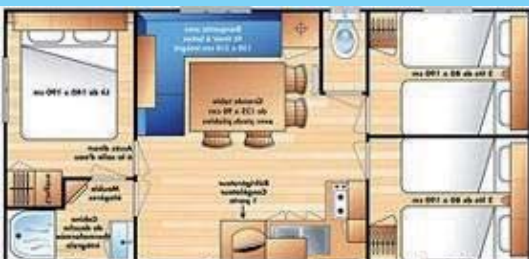
Mobil-home 31 m 2