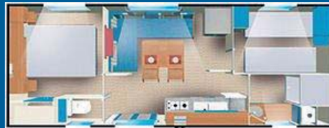
Mobil-home 23 ou 28 m 2